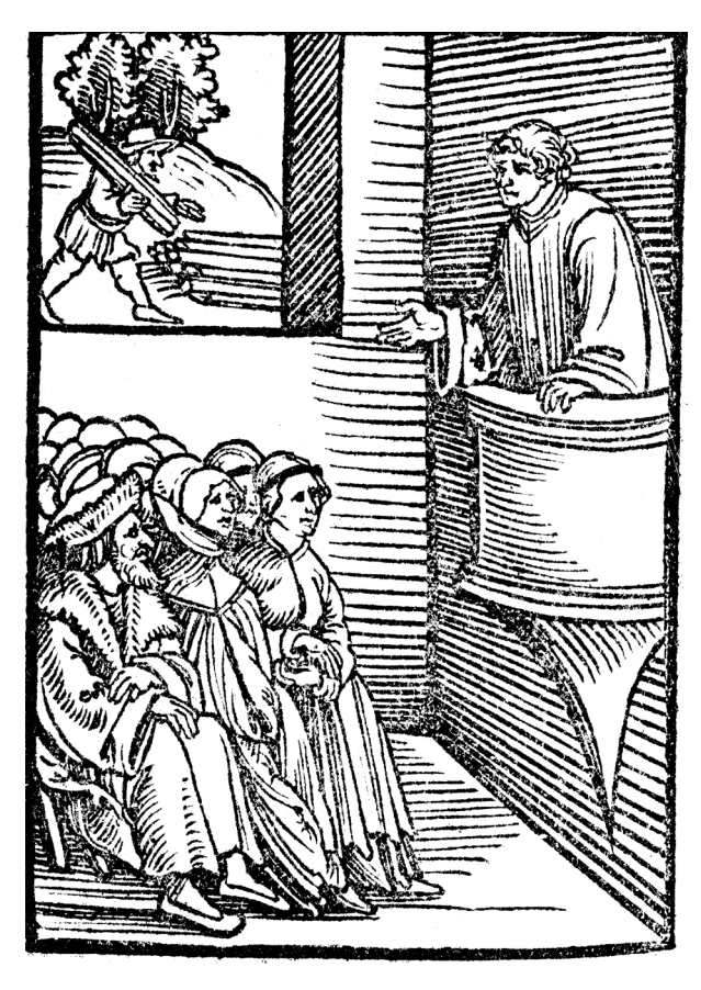
This image from 1533 Church Order, published by Evangelisch-Lutherische Kirche in Ansbach, illustrates a violation of the third commandment: "You are to keep holy the day of rest." While the congregation is gathered for Sunday worship and instruction, a man is working outside.

23. The 1580 Book of Concord published in Leipzig used the so-called Jena edition of Luther's works, which has a reversed order of the prefaces and omitted the private confession. The 2000 Fortress Press edition, reflecting an edition of the Book of Concord printed in Magdeburg, follows the second,